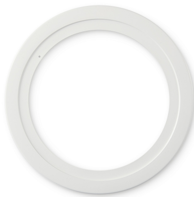
8" Goof Ring (70459)