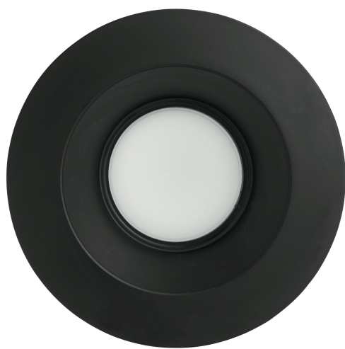
8-inch Trim - Round, Black Smooth (99546)