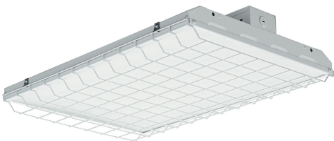
Wire Guard (99947)