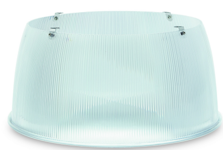
Acrylic Cone Reflector (70207)