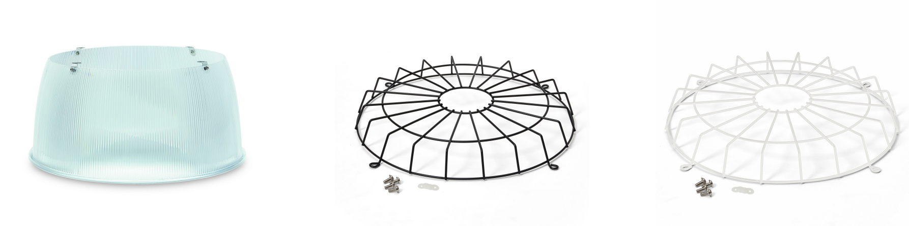
Acrylic Cone Reflector (70205)