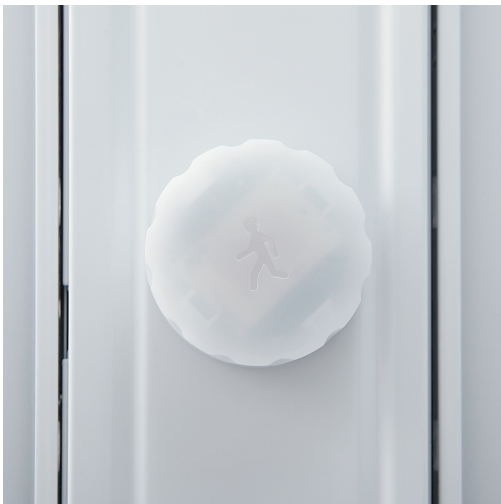
Highbay Sensor (70681)