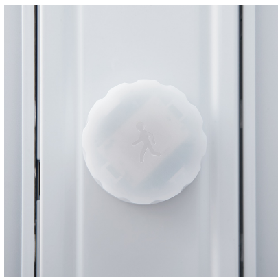
Highbay Sensor (70681)