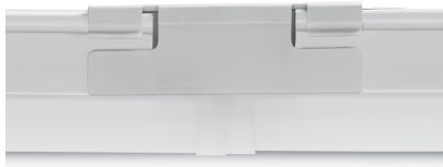
End-to-end Bracket (70687)