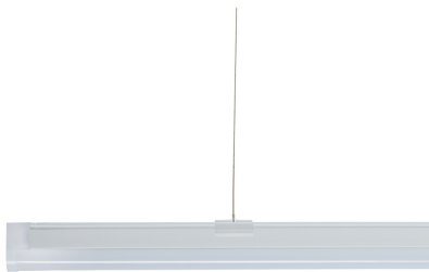
Suspension Kit (70688)