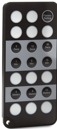
Batten Remote (98992)