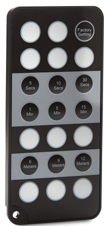
Batten Remote (98992)