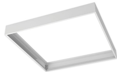
EM Kit - Converts standard Verbatim panel to Emergency Backup (99956)